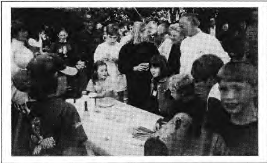
Friends and neighbors from land and sea gathered October 5th in the parking lot of the Tenas Chuck Moorage on Fairview Avenue East to celebrate the birth of Lake Union's newest cooperative.